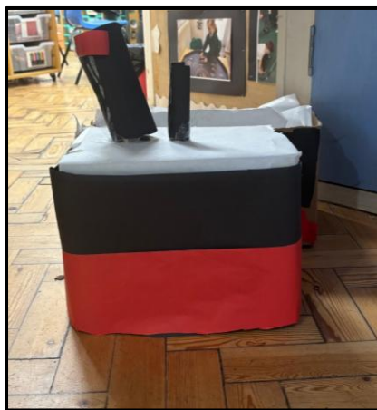
Woods Corner's Titanic