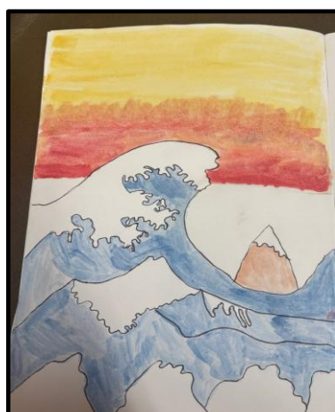
Isabelle's Hokusai's wave