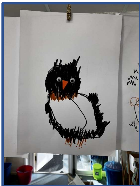
Dallington Classes amazing penguins

I wanted to share some pictures of the amazing work that is happening across the school.