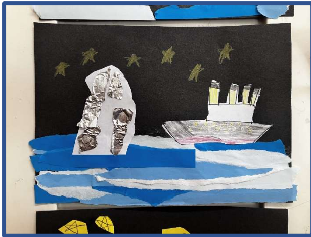
Woods Corner's Titanic collage